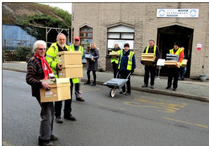
Volunteers from Llangollen Tidy Town team moved into to prevent priceless artefacts at the town's museum being damaged by rainwater pouring in from a defective roof.