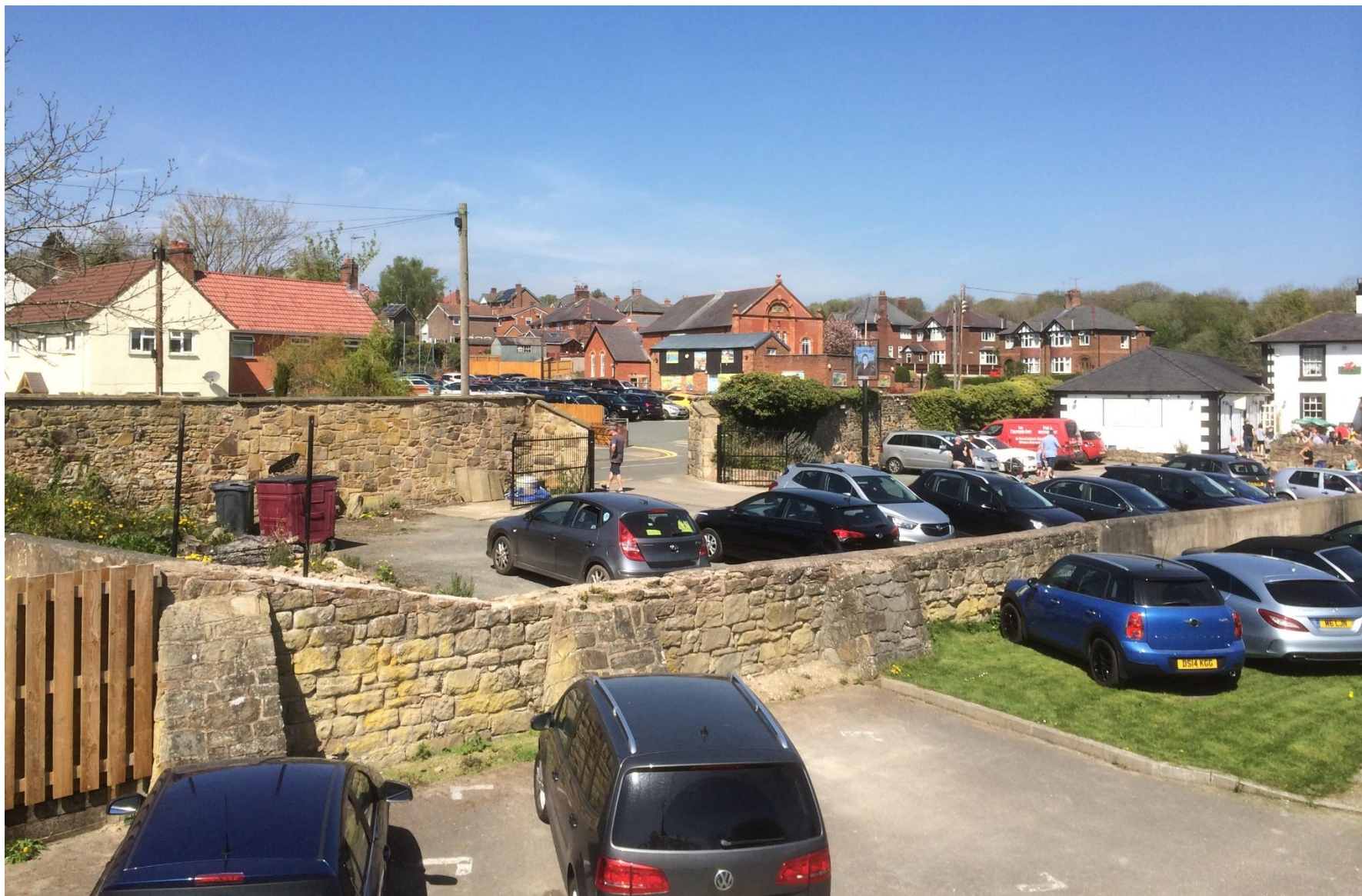
Another busy day for the Telford Inn and the Chapple Tea Room, very good to see, note Reads Yard Parking in distance full.