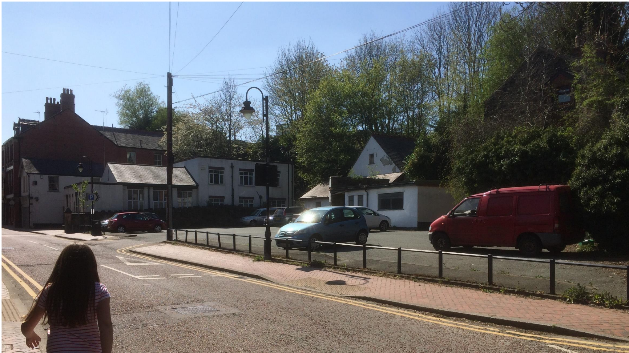
The Well Street Car Park in mid-afternoon.