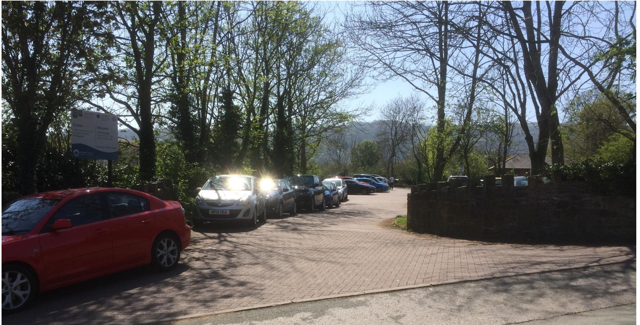
The Trevor Basin parking area full of disabled access drivers?