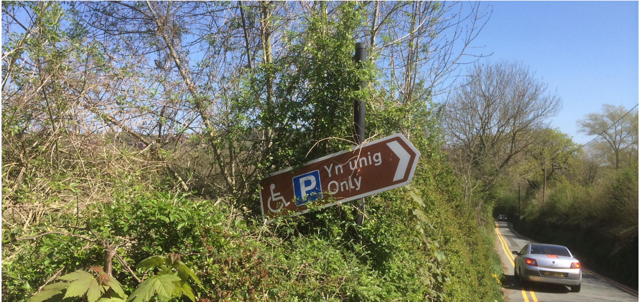
The sign post for the Trevor Basin DISABLED PARKING AREA?