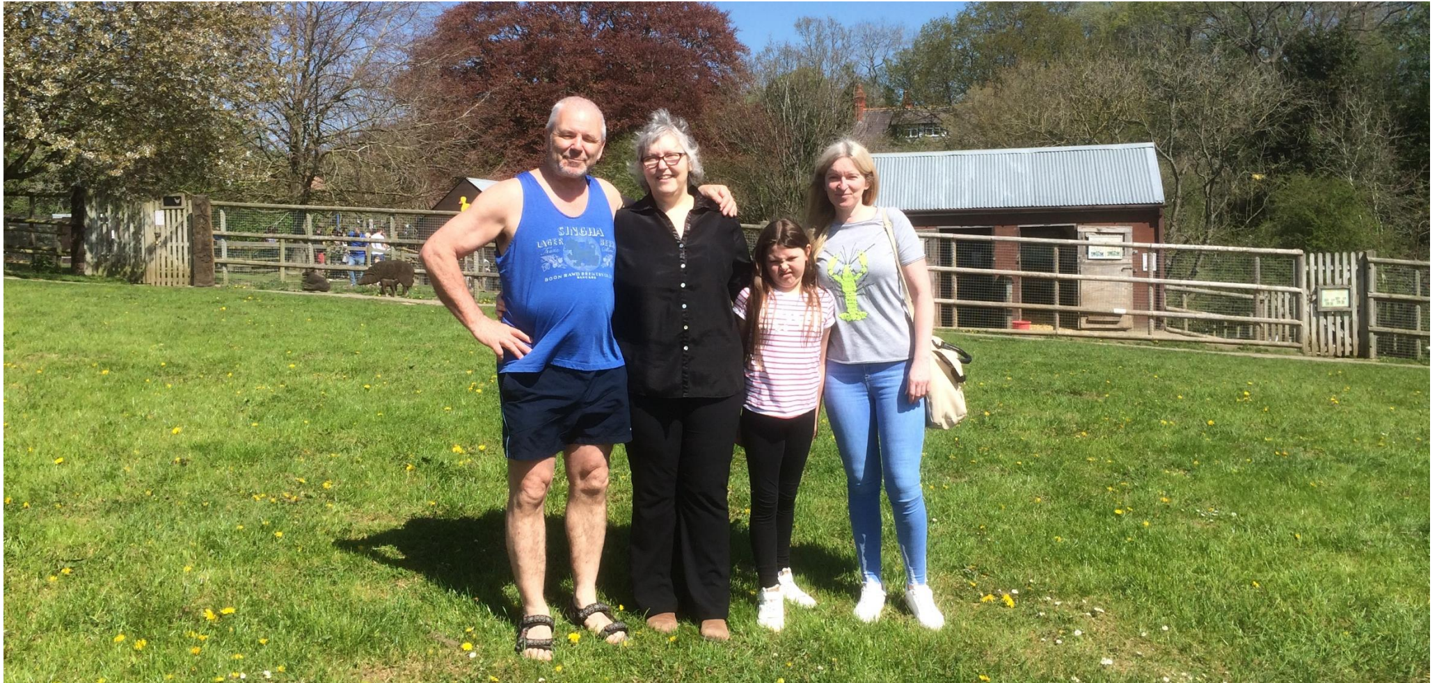
The 2019 Easter Bank Holiday Survey Team.