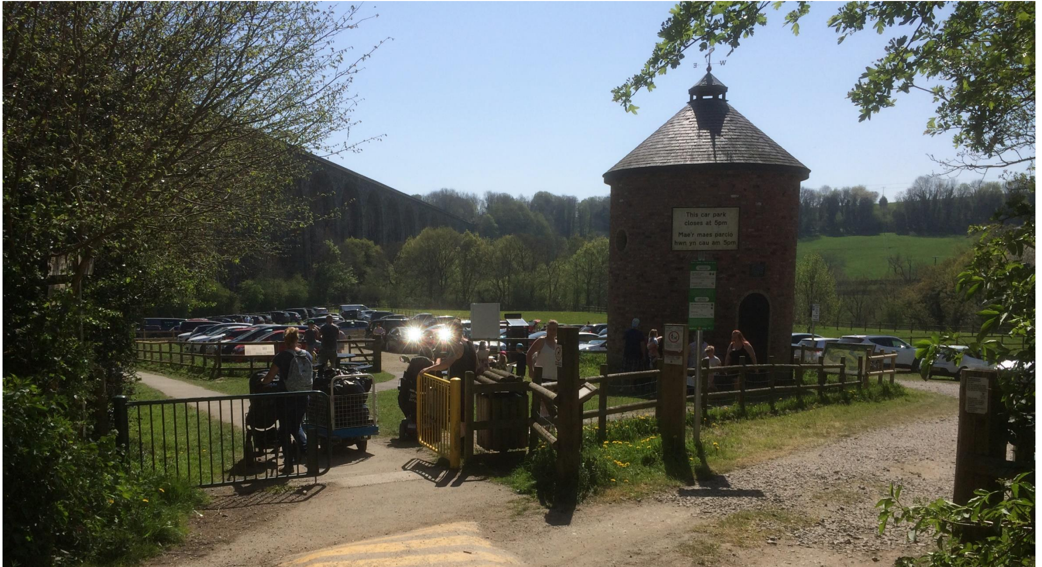
Ty Mawr Country Park overflow car park full, very good to see, even if an encroachment on green field.