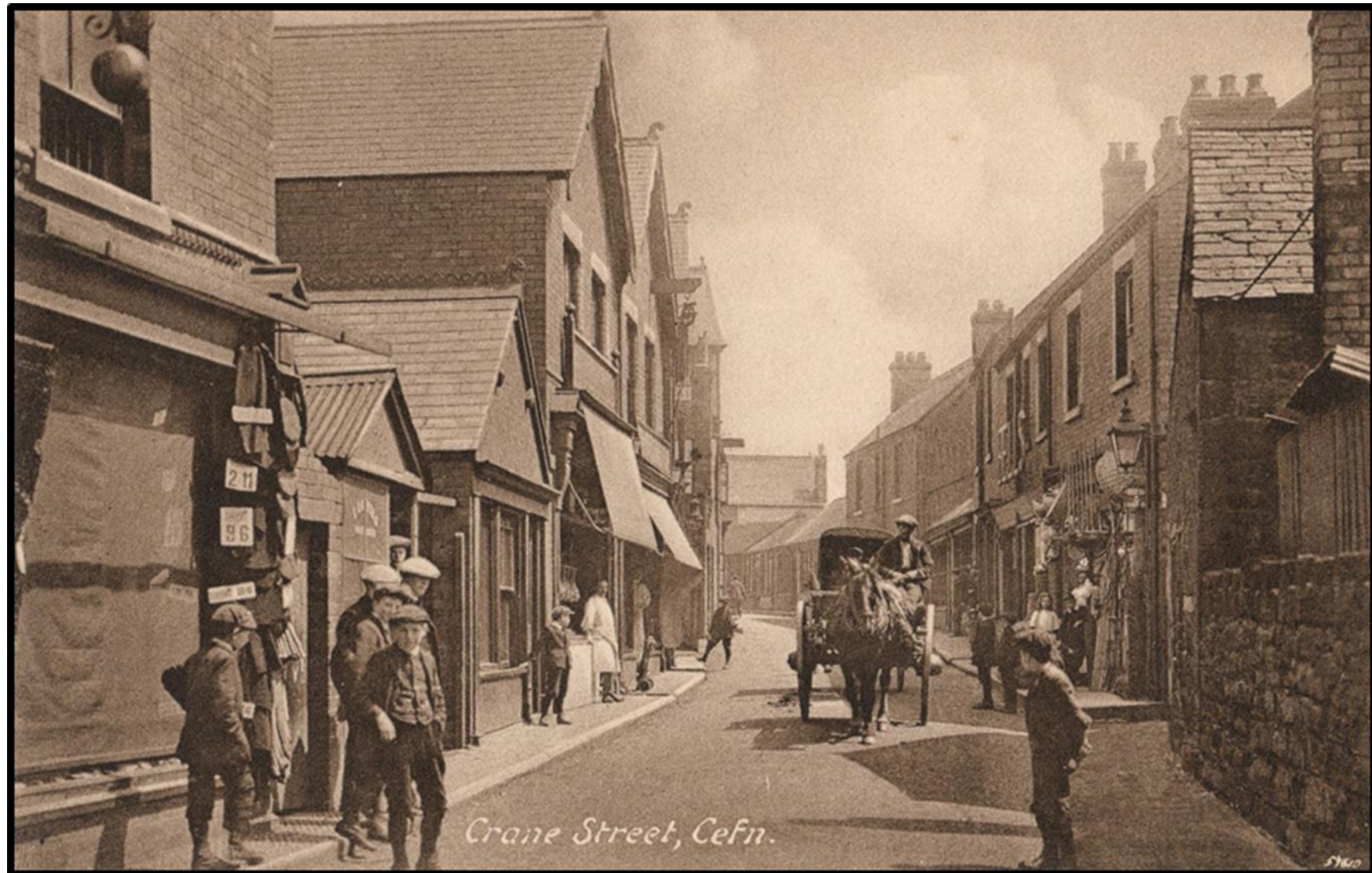
Crane Street before the age of the motor car and tourism.