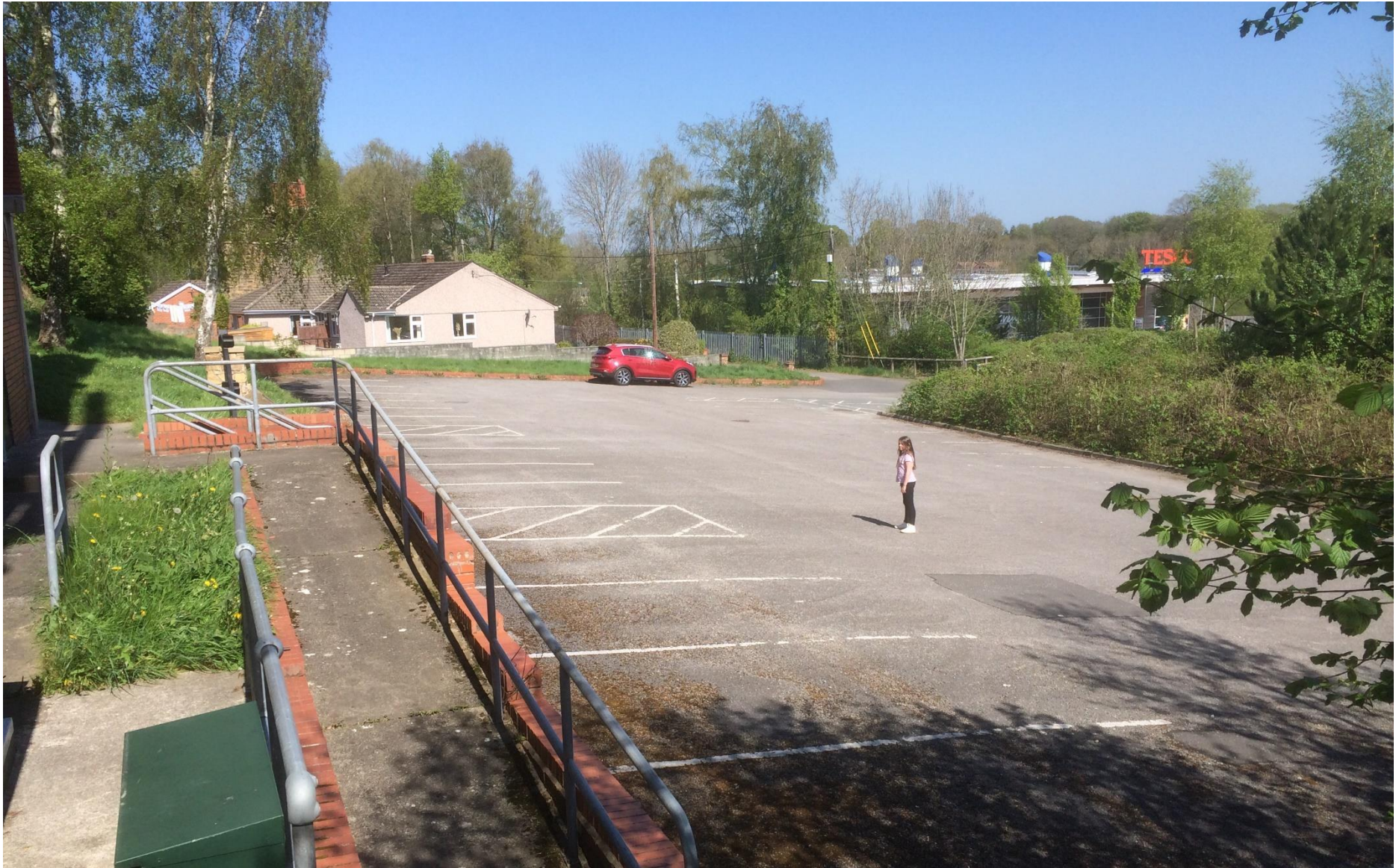
The GEH Car Park empty as usual.