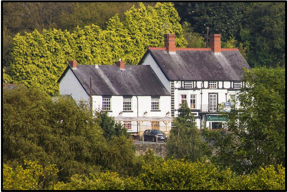
The Queens Hotel as seen from Trevor Basin and the Pontcysyllte Aqueduct.