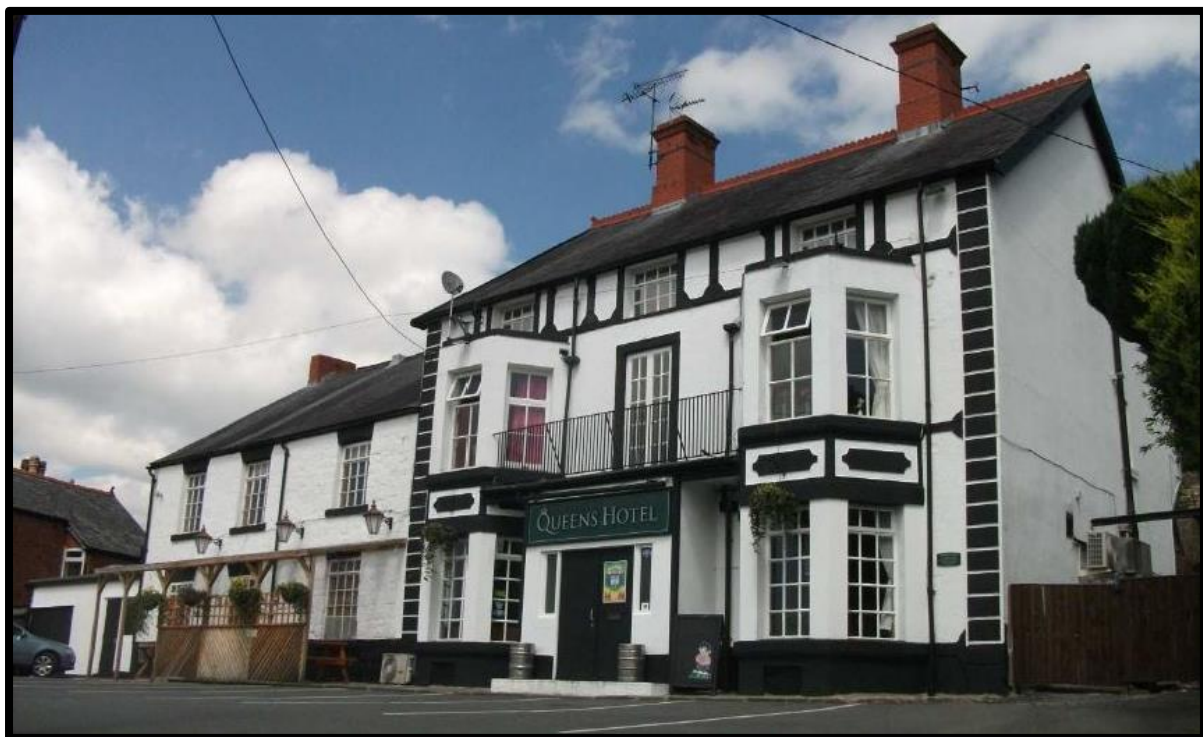
The Queens Hotel 2014