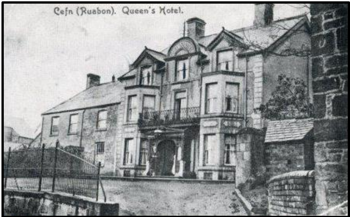
The Queens Hotel in about 1900, note the addition to the left of the building.