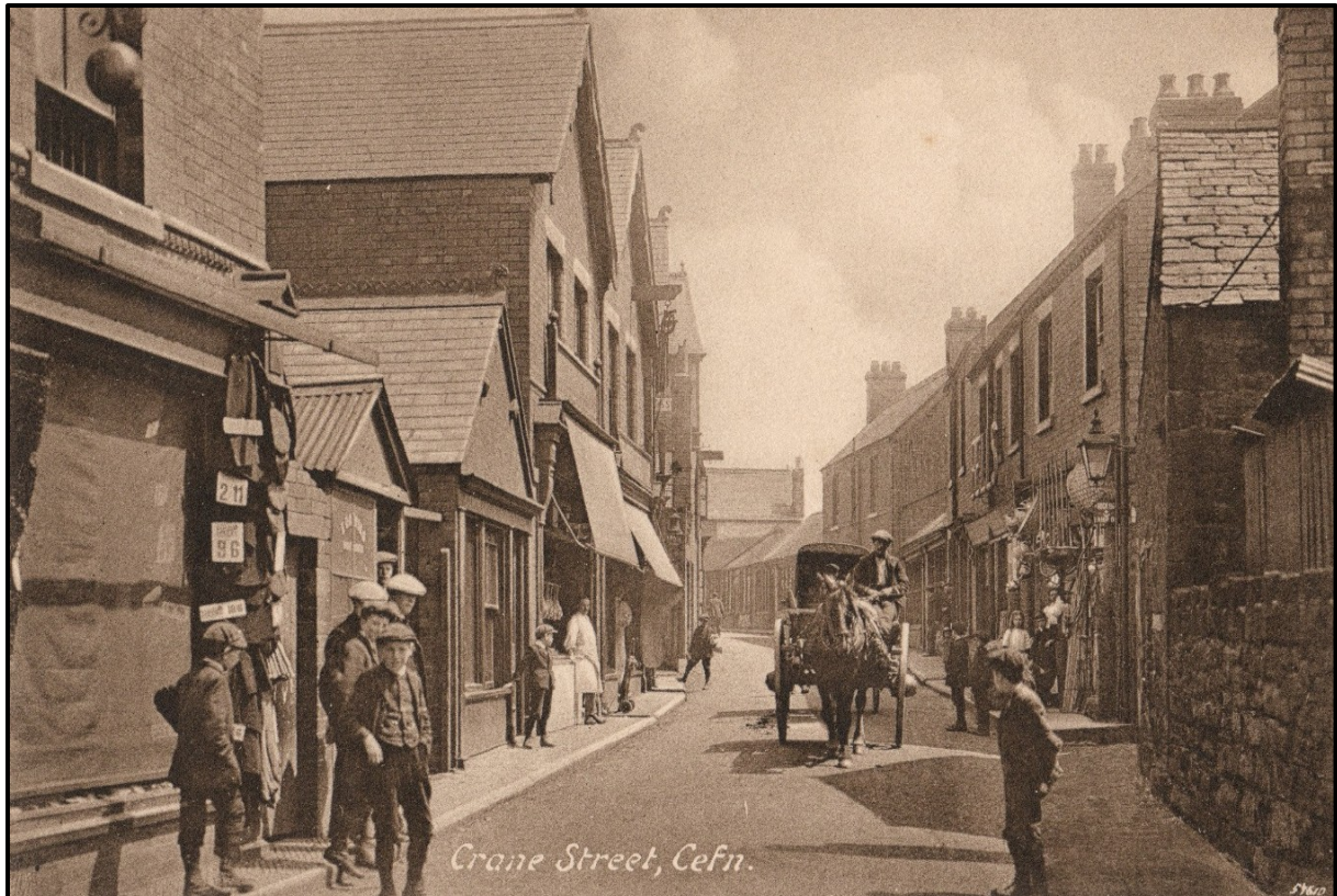
Hackney carriage service on Crane Street Cefn Mawr early 1900's