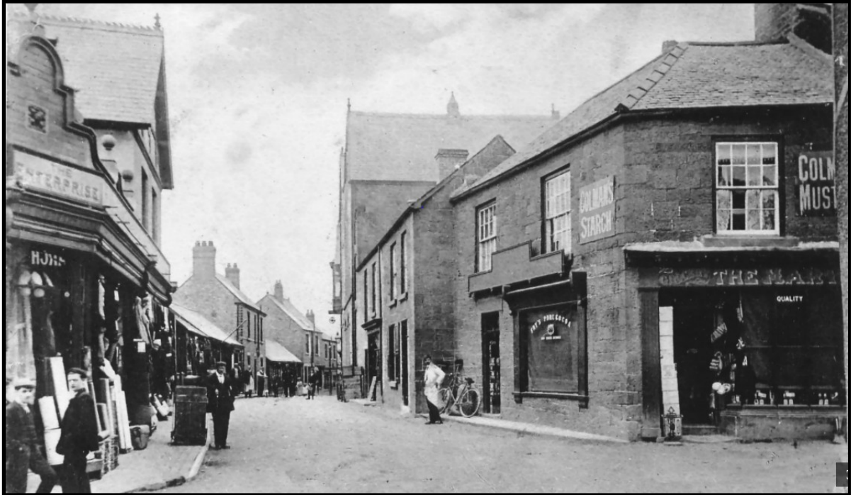
Crane Street 1910