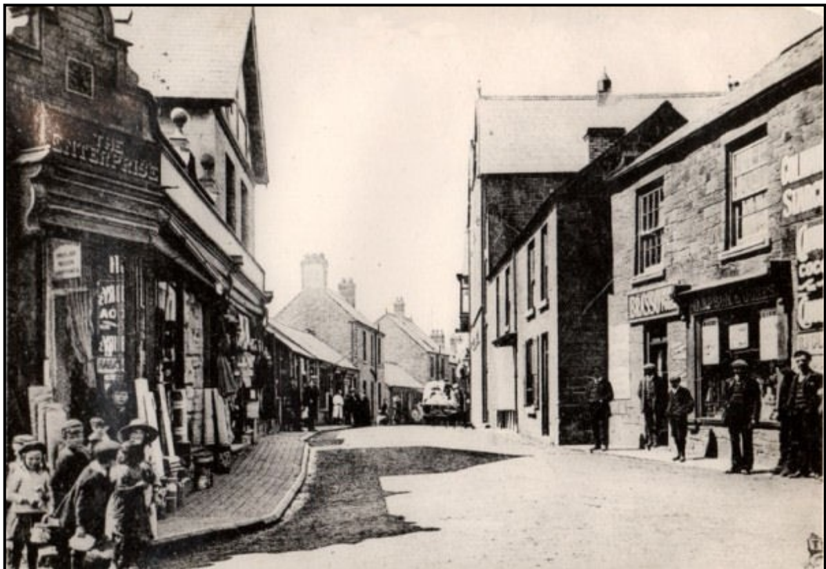
Crane Street 1900

Email: info@festivalfireworks.co.uk Website: http://www.festivalfireworks.co.uk