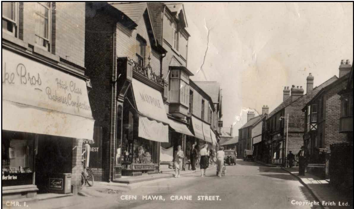
Crane Street Cefn Mawr in the 1950's