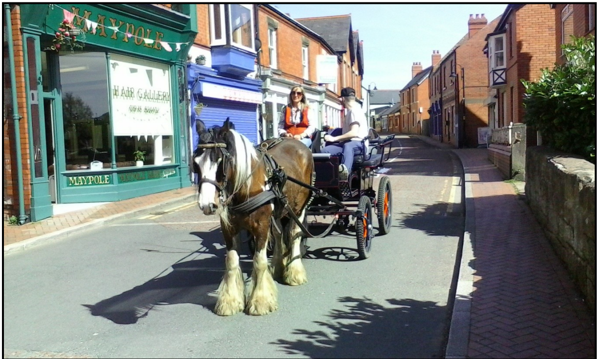
Hackney carriage service on Crane Street Cefn Mawr for the 21 st century, this carriage sits five passengers in addition to the driver and Jessop's Tramway reopened will simply allow it to operate between Cefn Mawr, the Aqueduct and Windborne Gate Parking.