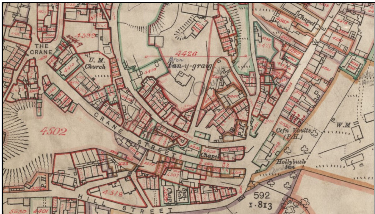
Crane Street 1912 Cefn Mawr