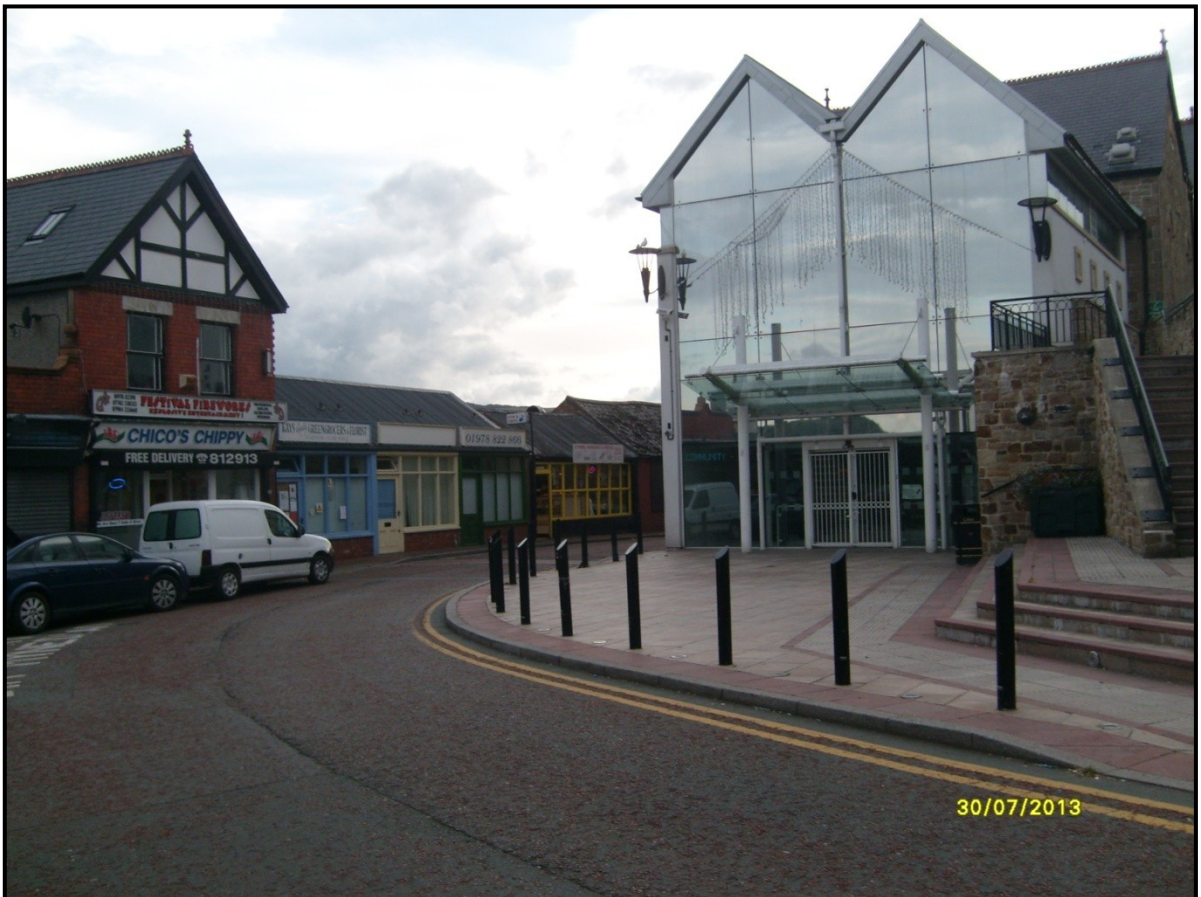
The Ebenezer at the top of Crane Street on Cefn Square 2013