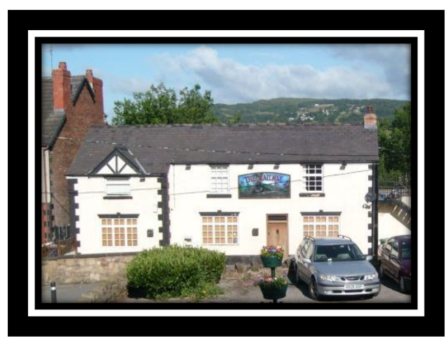
The Railway Inn, The Crane, Cefn Mawr