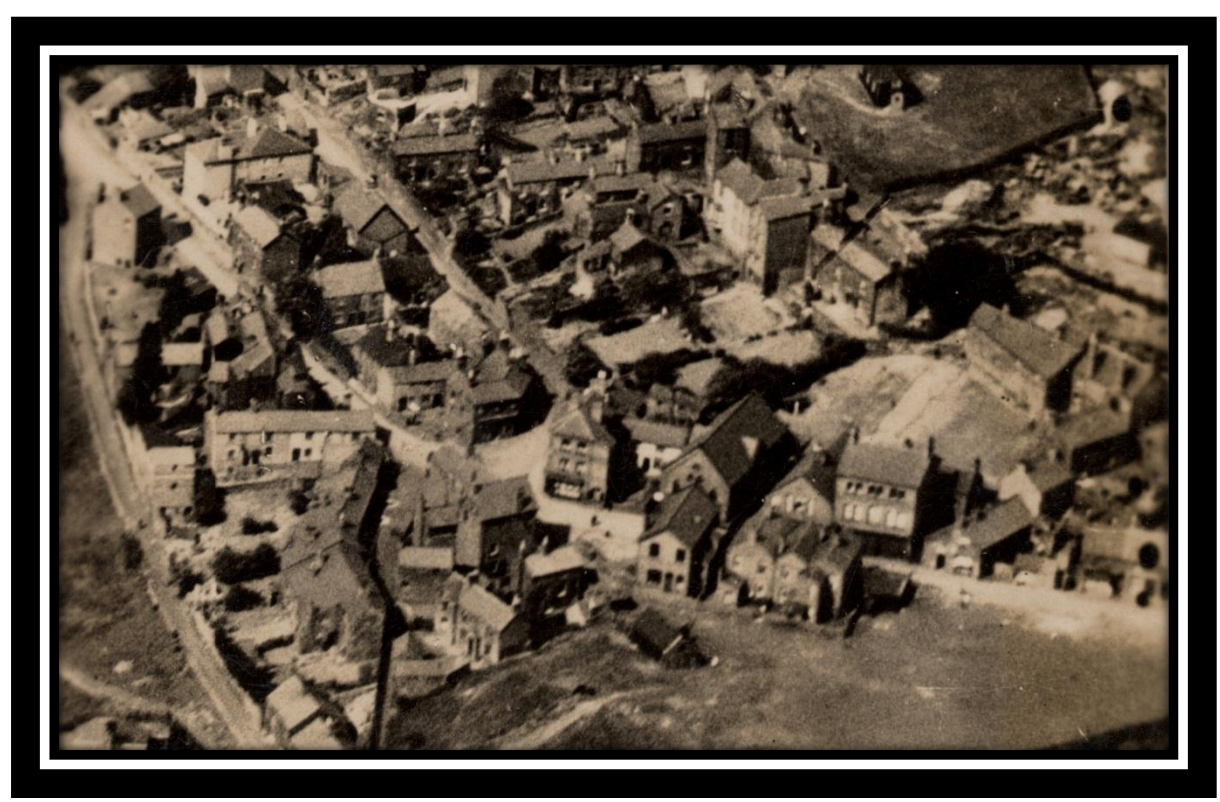
The Crane, Cefn Mawr in the 1930s