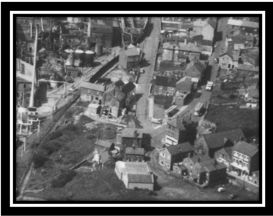
The Crane, Cefn Mawr in the 1960s