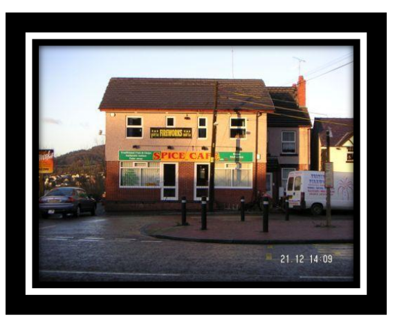
The Spice Cafe, The Crane, Cefn Mawr, LL14 3AA