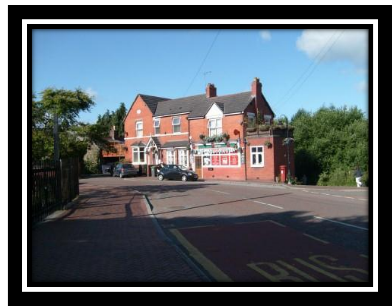
The Post Office, Crane Street, Cefn Mawr, LL14 3AB