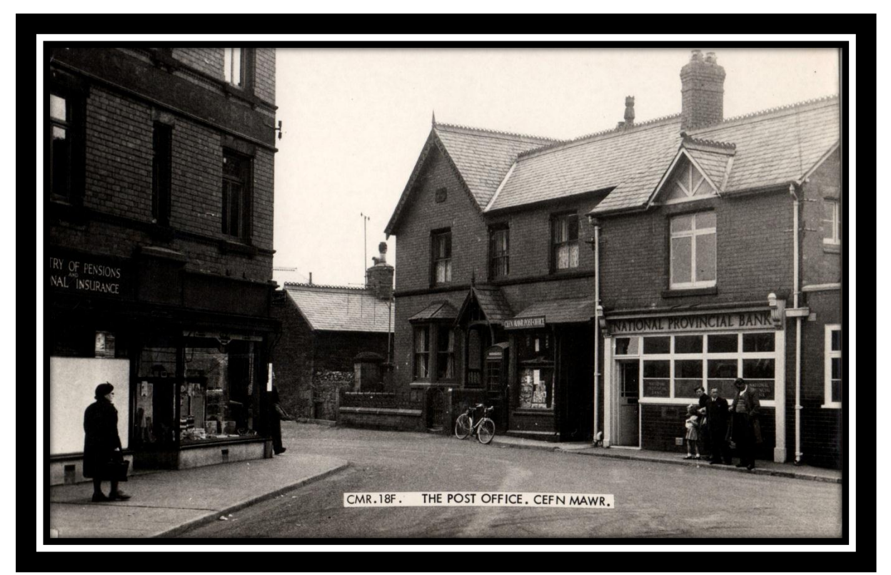
Cefn Mawr Post Office in the 1940s at the Crane, Cefn Mawr